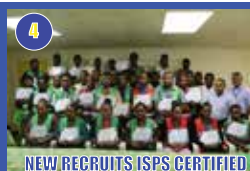
NEW RECRUITS ISPS CERTIFIED