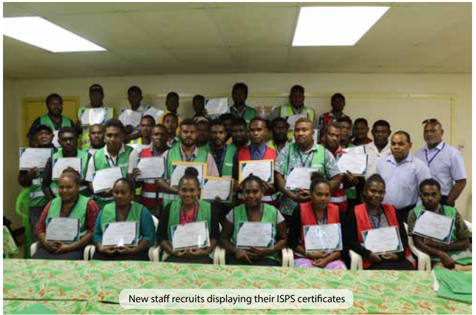
New staff recruits displaying their ISPS certificates

"Tabletop exercises were conducted, they were divided into four groups and interacted with each other's, the four group were being given times to display their drills and exercise it helps them to