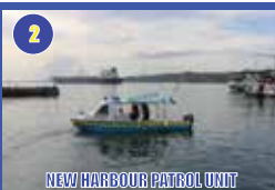
NEW HARBOUR PATROL UNIT