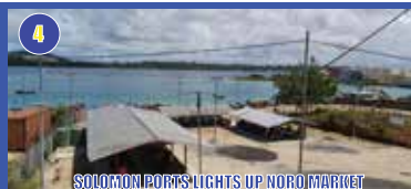
SOLOMON PORTS LIGHTS UP NORO MARKET