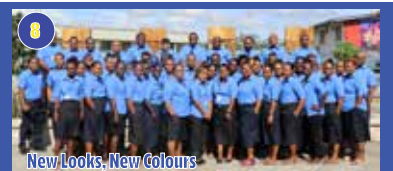
New Looks, New Colours