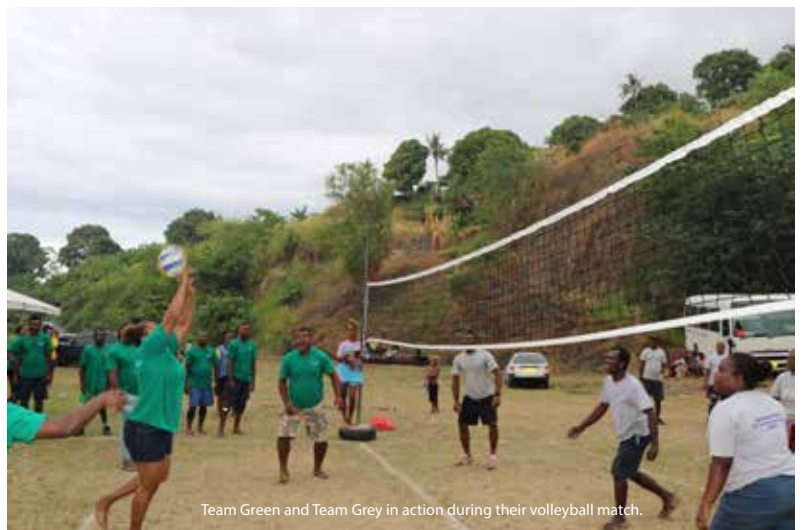
Team Green and Team Grey in action during their volleyball match.

"The version of this year's games was better than the past year's games."