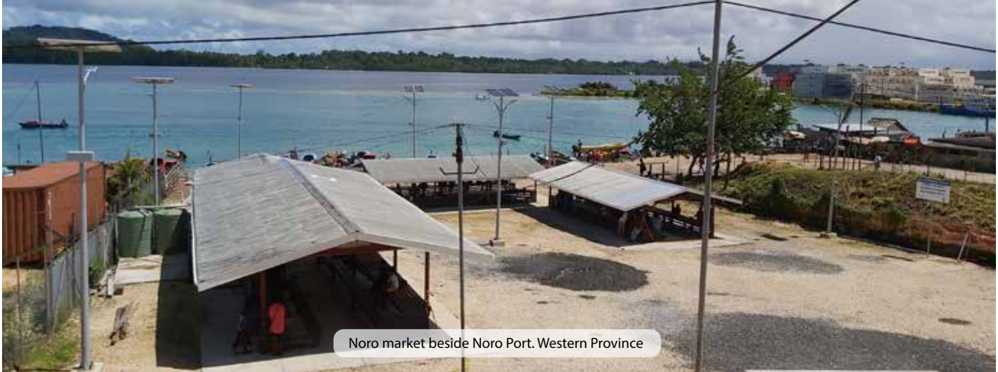
Noro market beside Noro Port. Western Province

Solomon Ports has recently commissioned new solar lighting poles for Noro Market in the Western Province.