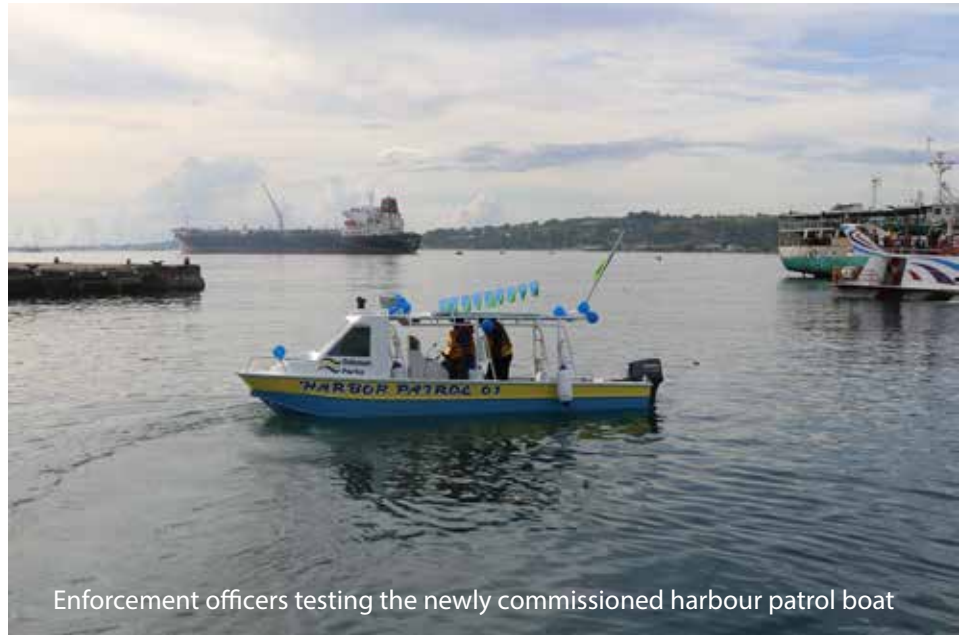
Enforcement officers testing the newly commissioned harbour patrol boat

He said currently there were 4 officers who are