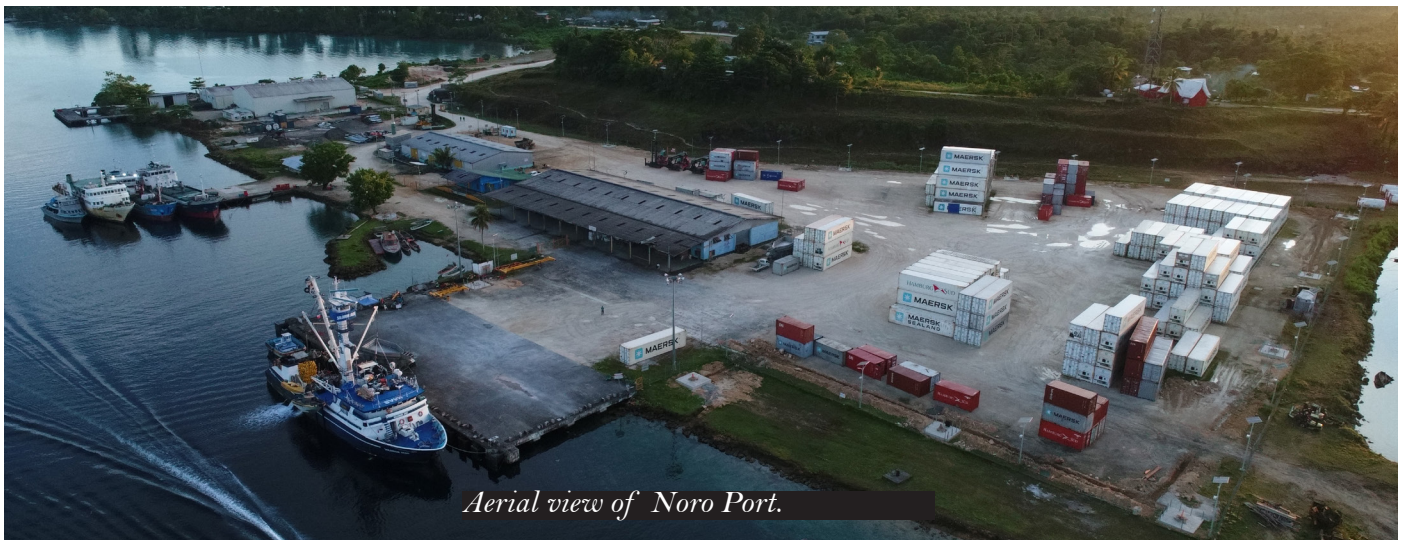
Aerial view of Noro Port.

Construction on the New energy efficient Light poles at Noro Port, Western Province is now under-way.