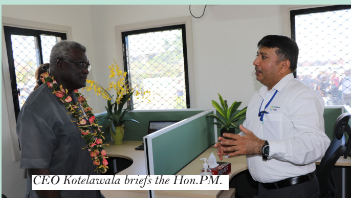
CEO Kotelawala briefs the Hon.PM.

Speaking during the commissioning event, Prime Minister Sogavare was deeply impressed with the progress made by Solomon Ports and the continuous development projects in place to improve port infrastructure in both the Port of Honiara and Noro.