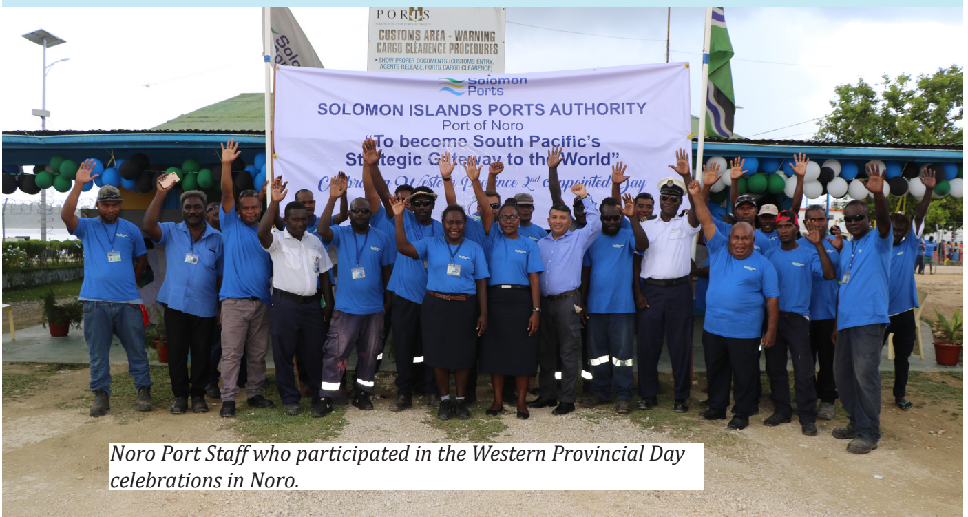
Noro Port Staff who participated in the Western Provincial Day celebrations in Noro.

As part of the Western provincial day celebrations, Noro Port staff also took part in the celebrations. They took part in the official parade at the Noro Tuna park, where hundreds of Noro residents turned out to witness the historic event. The Noro port team were all dressed in blue for the occasion and were proud and glad to celebrate and show SIPA's ongoing contributions to the Noro Port and Western province.