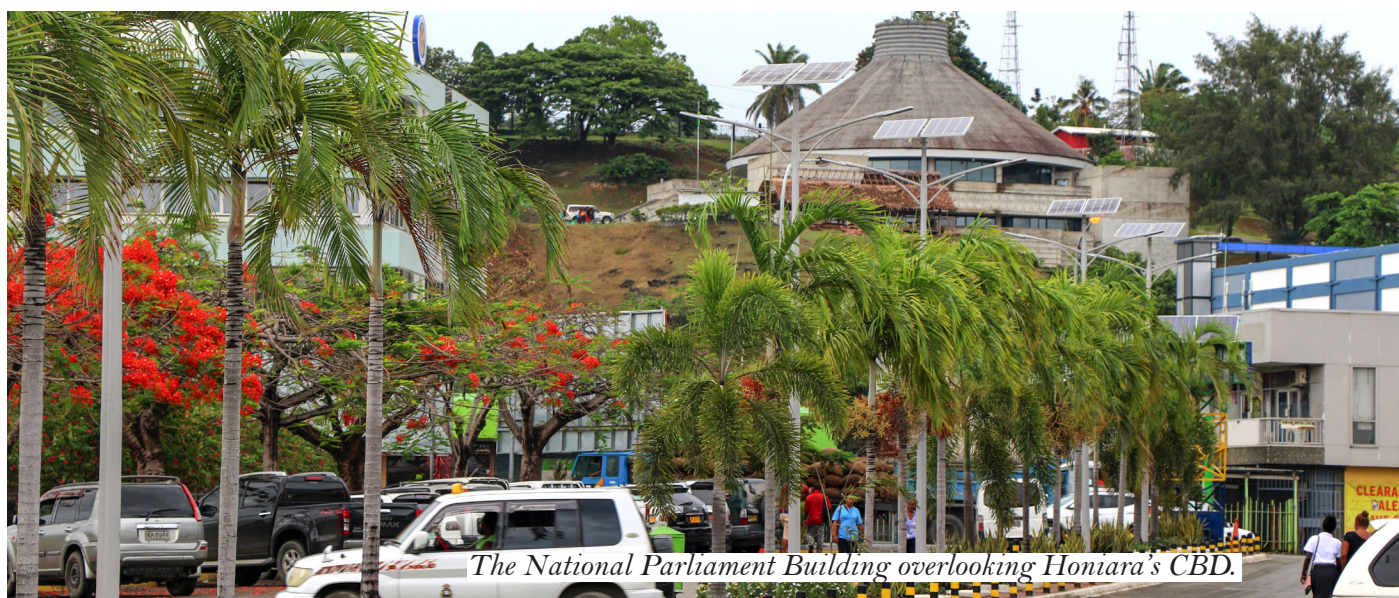
The National Parliament Building overlooking Honiara's CBD.

He said he hopes other SOE's or companies in Honiara would also do the same in giving back to the community and help improve the standard and image of Honiara city.