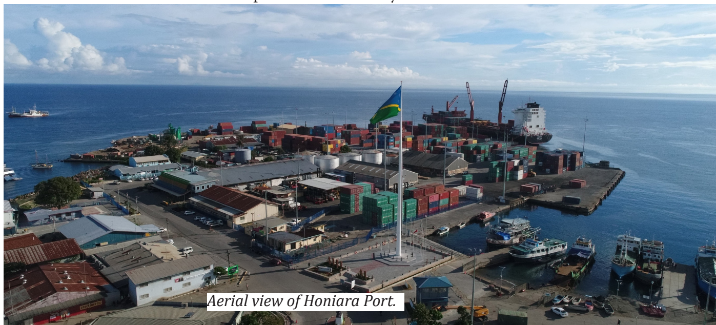
Aerial view of Honiara Port.

Mr. Pade said the transformation project also included the planting of trees and flowers around the port facility to beautify working environment.