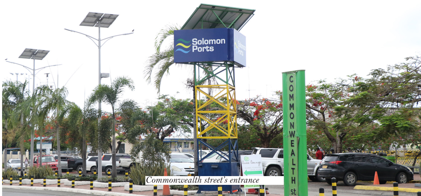
Commonwealth street's entrance