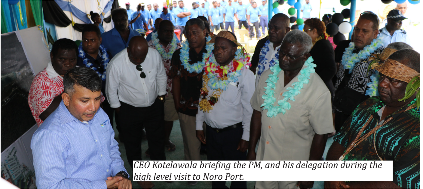
CEO Kotelawala briefing the PM, and his delegation during the high level visit to Noro Port.

Prime Minister Hon. Manasseh Sogavare paid a courtesy visit to the Port of Noro, Western Province.