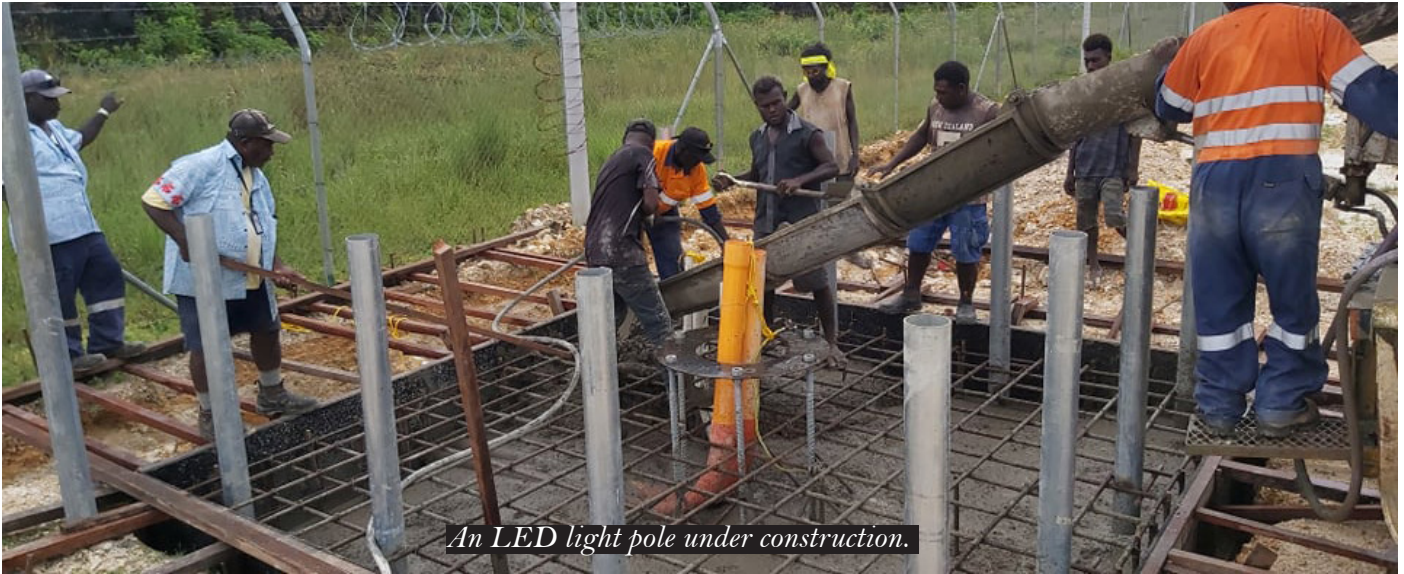
An LED light pole under construction.