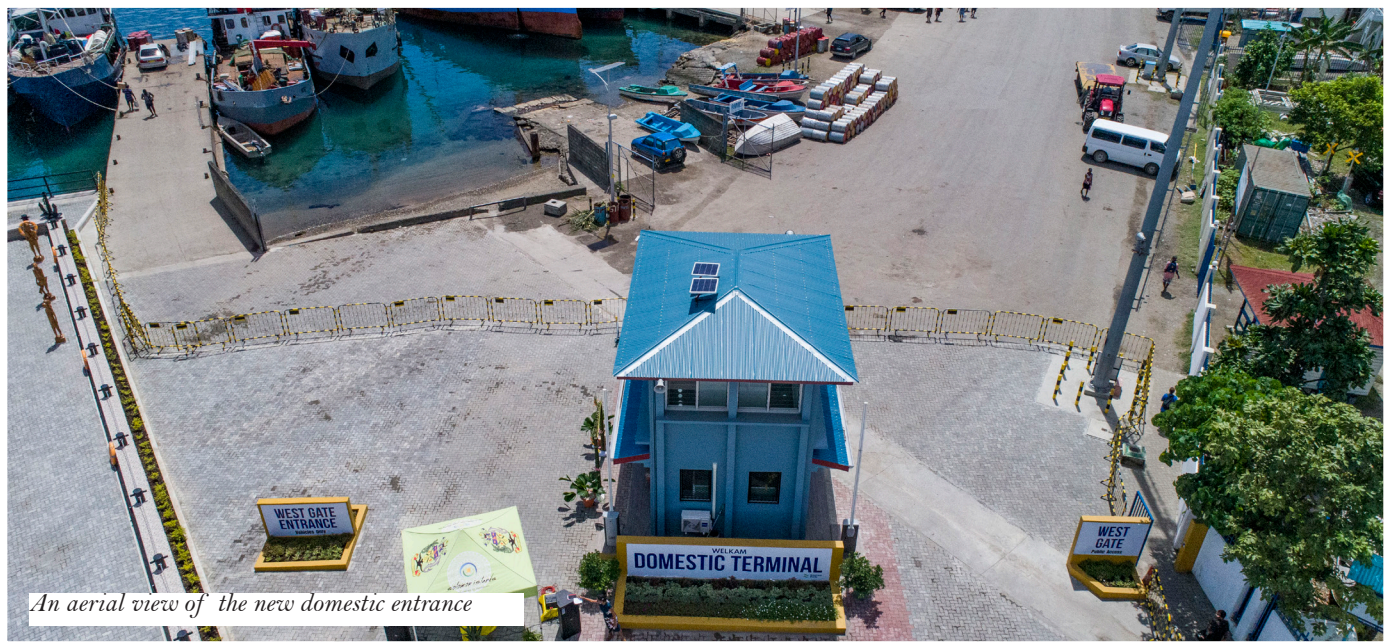
An aerial view of the new domestic entrance

Solomon Ports has officially commissioned the new 'Domestic Port Terminal Gate House' at the Honiara Domestic Terminal.