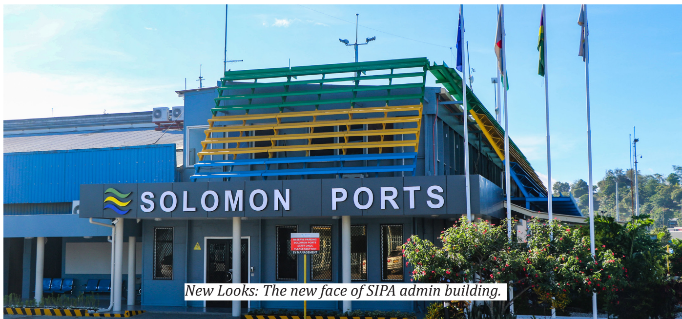
New Looks: The new face of SIPA admin building.