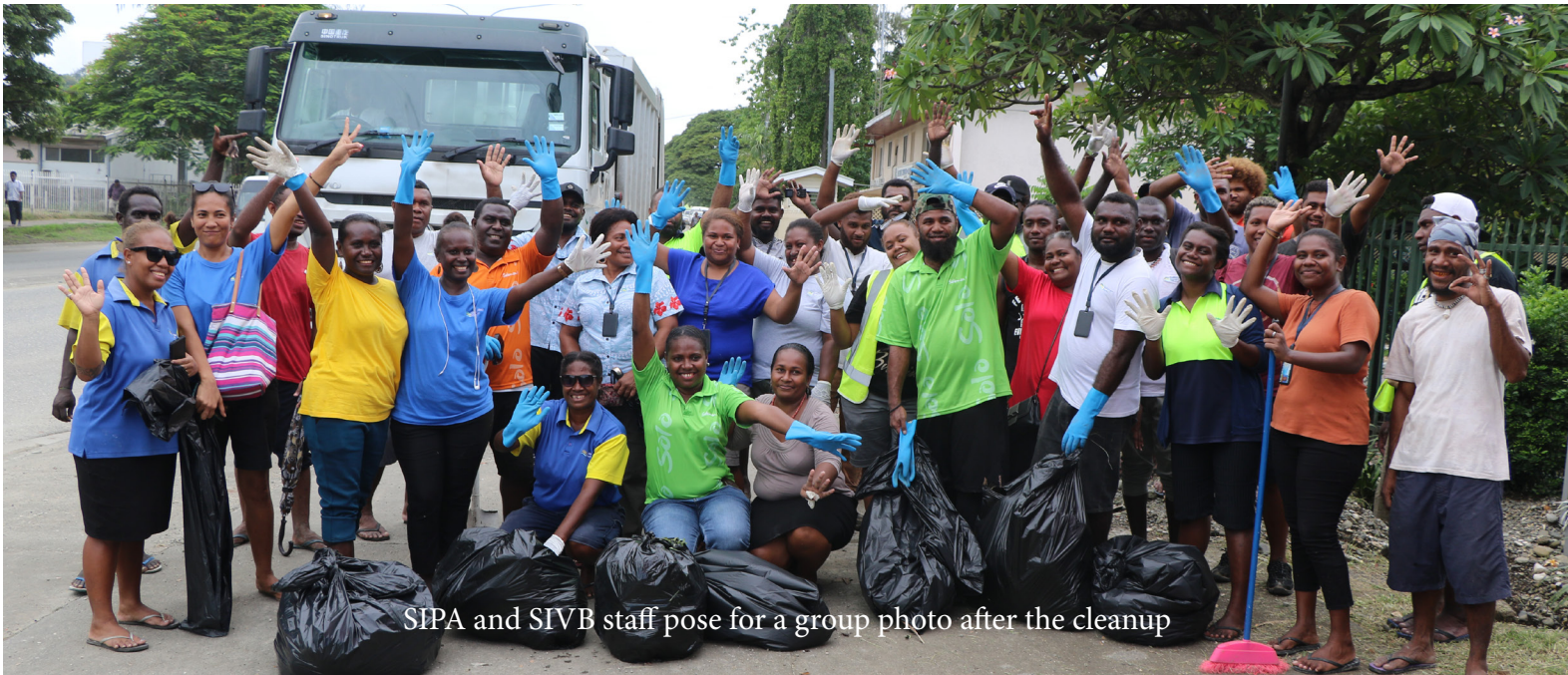
SIPA and SIVB staff pose for a group photo after the cleanup