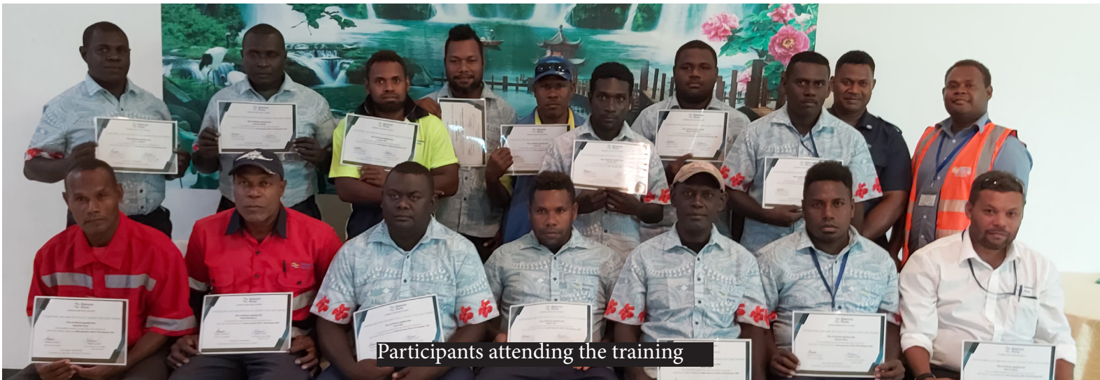
Participants attending the training

Noro Staff successfully held their quaterly International Shipping and Ports Security (ISPS) training on April.