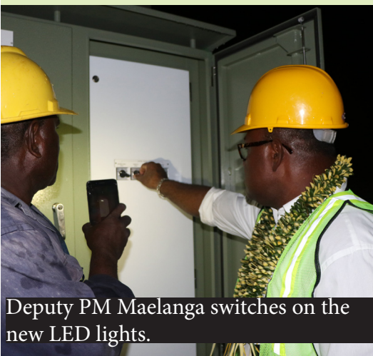
Deputy PM Maelanga switches on the new LED lights.

Solomon Ports has officially commissioned the first ever LED lighting system and CCTV fibre Network for Noro Port, Western Province, on 10th May.