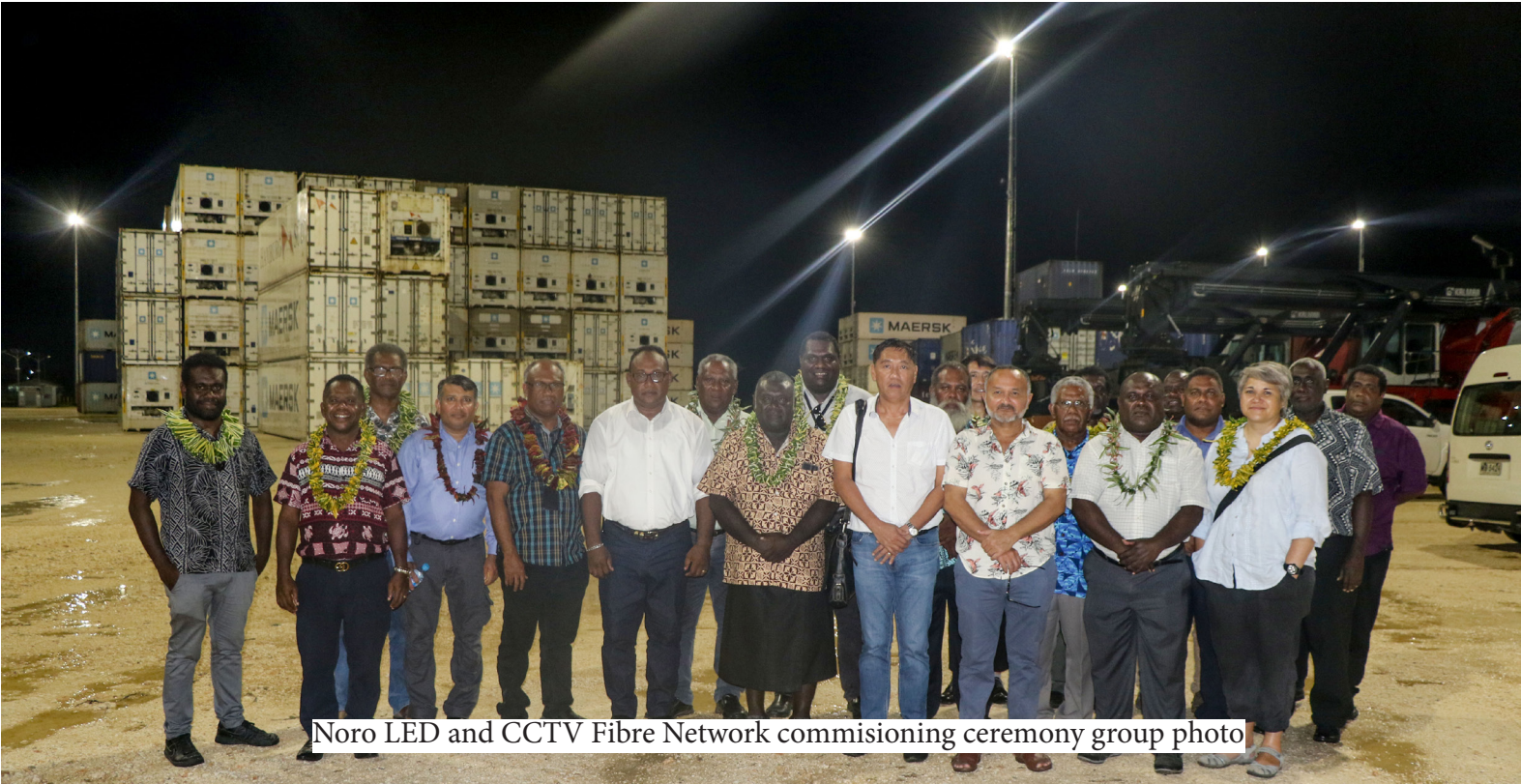
Noro LED and CCTV Fibre Network commisioning ceremony group photo