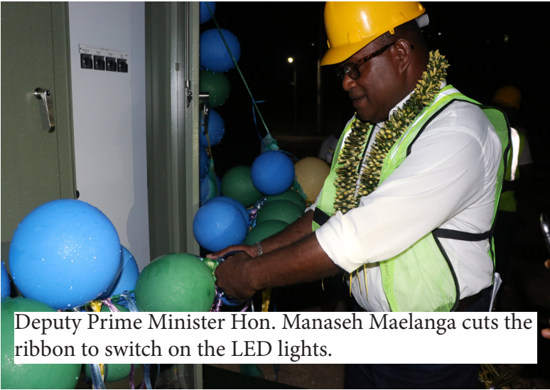
Deputy Prime Minister Hon. Manaseh Maelanga cuts the ribbon to switch on the LED lights.