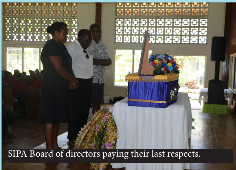
SIPA Board of directors paying their last respects.