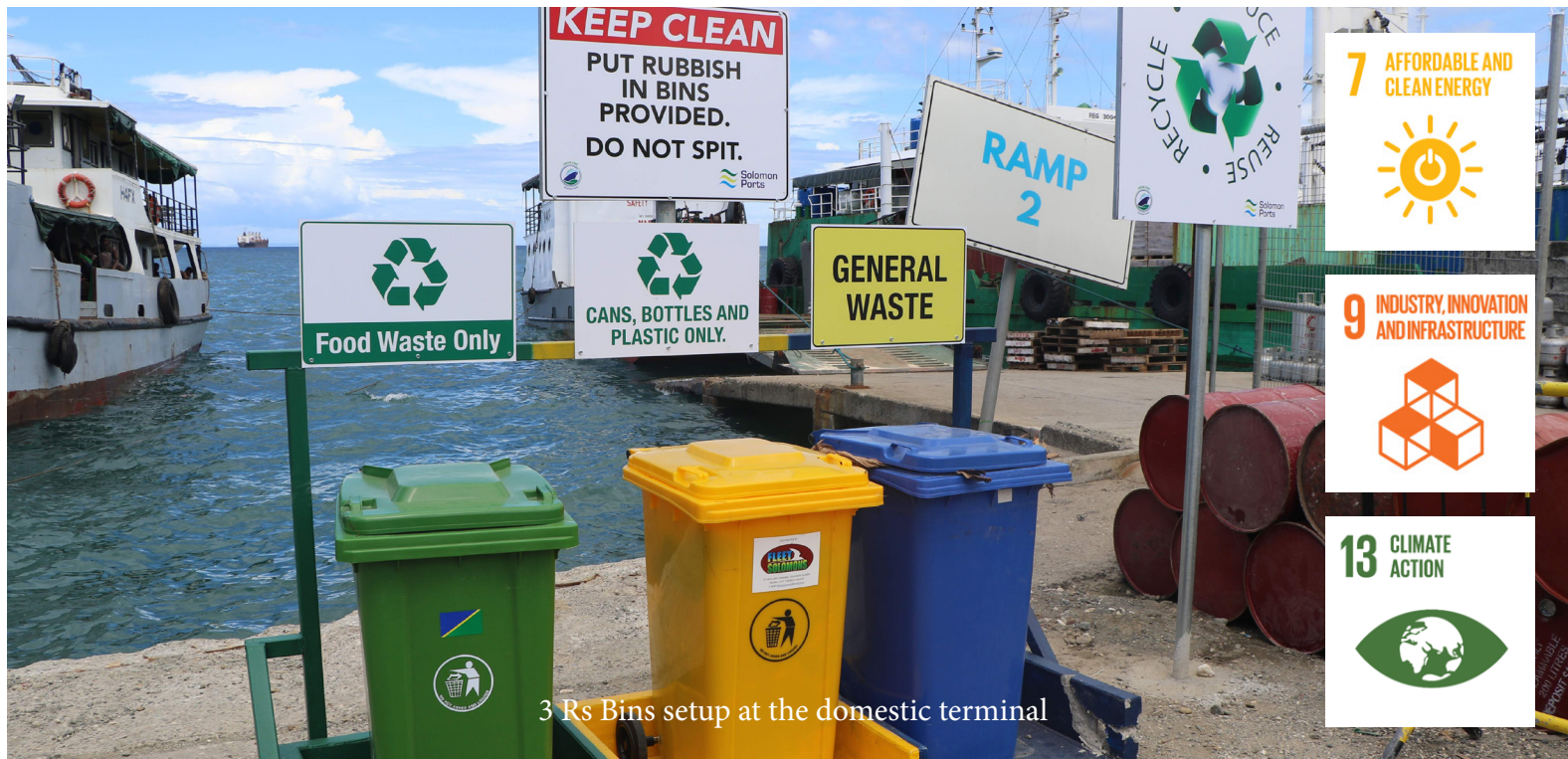
3 Rs Bins setup at the domestic terminal

Solomon Ports has now commenced the 'Reduce, Reuse, and Recycle' (3 rs) campaign in Honiara.