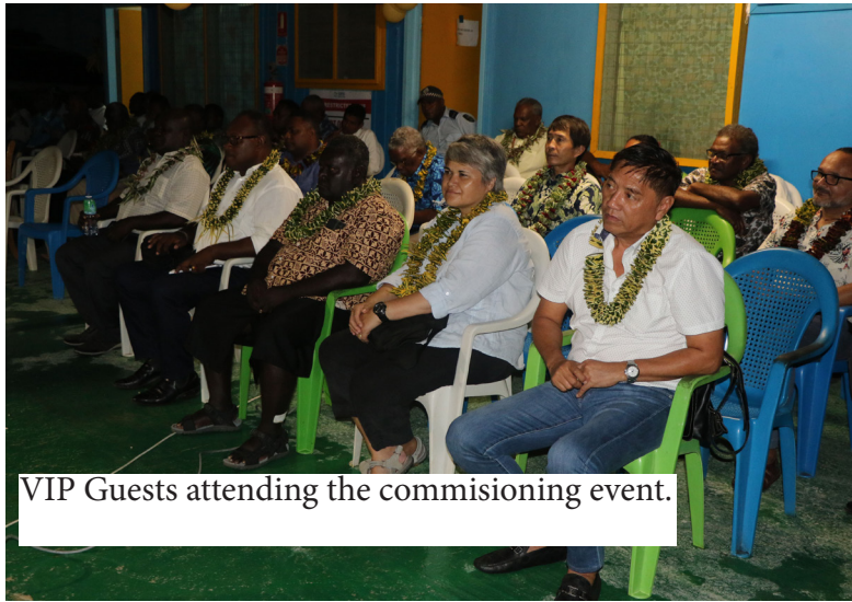
VIP Guests attending the commisioning event.