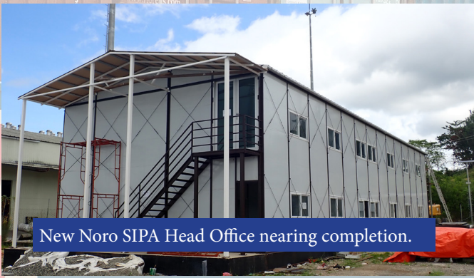
New Noro SIPA Head Office nearing completion.