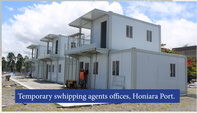
Temporary shipping agents offices, Honiara Port.