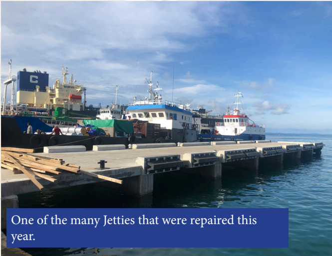
One of the many Jetties that were repaired this year.