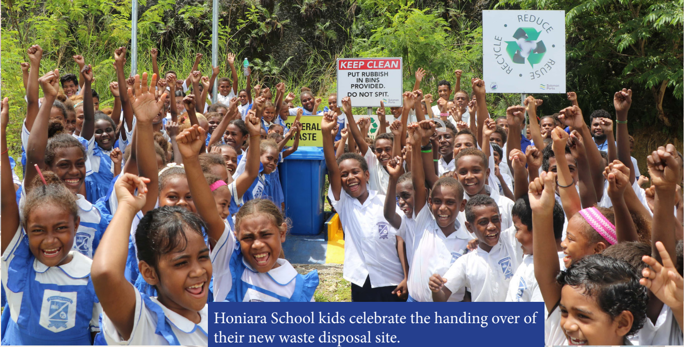
Honiara School kids celebrate the handing over of their new waste disposal site.

This year Solomon Ports continues to gain positive strides in the rollout of its Green Port Initiative. We began the year with the donation of over 10 used heavy machineries to the Solomon Islands National University's Automotive Engineering Department in January, this is part of our corporate responsibility and reusing strategy, which instead of selling, were donated to SINU students and to offer them firsthand experience with such sophisticated machines. Also, In January also saw the launch of our '3 Rs' campaign, when SIPA engaged 7 schools in Honiara to take part in, this campaign involves the development of waste collection sites in school by SIPA, and awareness on how to practice Reducing, Reusing, and Recycling of wastes at school and at home, which the campaign is still active and will further extend to the provinces soon. In May, SIPA also completed and commissioned the mega LED