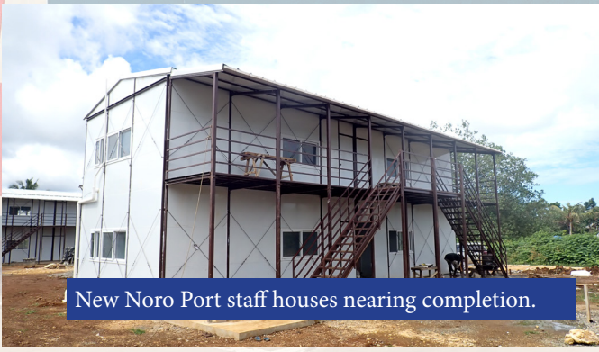
New Noro Port staff houses nearing completion.