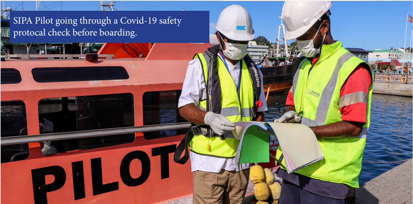
SIPA Pilot going through a Covid-19 safety protocol check before boarding.

This year the Global Pandemic instilled by Covid-19 has hit hard on economies around the world, fortunately Maritime trading continued despite the many challenges brought in by Covid-19 inspired lockdowns. Since the pandemic emerged in 2019, Solomon Ports has developed strategies and solutions to ensure no transmission comes through the port of Honiara and Noro. These strategies include the development and completion of an 'Emergency Response Compound', which can house over 80 staff during the event of a lockdown, the facility is already in use throughout this year and will be used to ensure the Port remains operational during or if a lockdown is ordered by authorities. This year all our front-line staff have been equipped with PPEs, and strict Covid-19 protocols were also practiced by our staff when boarding foreign cargo vessels. We have also acquired cabin sanitizers to be used by our stevedores when working aboard foreign vessels, we also continue to work closely with the Government, especially the Ministry of Health to ensure Covid-19 is not transmitted through the port, which so far, the results have been in our favor. Our strategic response to the pandemic has ensured the local economy continues, and we have remained resilient in the midst of the pandemic, ensuring Solomon Islands remains connected with the outside world.