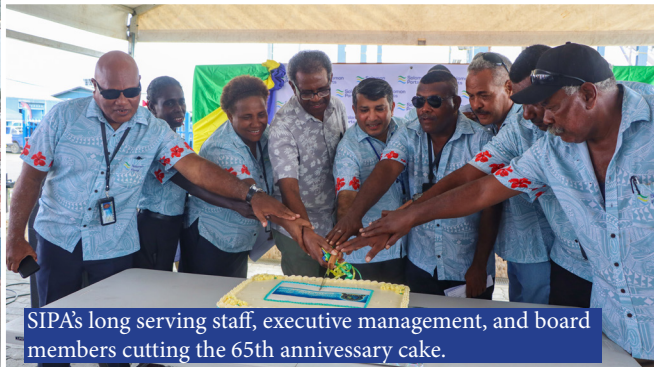
SIPA's long serving staff, executive management, and board members cutting the 65th anniversary cake.