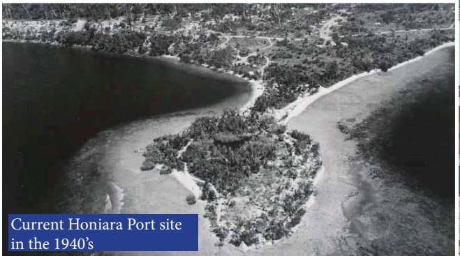
Current Honiara Port site in the 1940s

annum. Throughout the years, the Ports' transformation and development has also contributed to the economic drive of the country, through facilitating international and domestic trade. Over the recent years, through our partnerships with global maritime trading partners and other regional ports, SIPA is on its way to leading the maritime trading environment in the Pacific region, and as the Pacific's gateway to the world. Our modern initiatives to ensure the Port remains sustainable, and operated efficiently has been recognized globally, especially on our efforts to ensure the port consistently meets international standards. The 65th Anniversary celebration this year was commemorated on the 4th of June at the Unity Square, and was attended by all SIPA staff, and board of directors. The event featured speeches from long serving SIPA staff, who took the occasion to reflect upon their journey and career with SIPA. A photo Exhibition was also on display for staff and members of the public to view SIPA's transformation over the last 65 years.