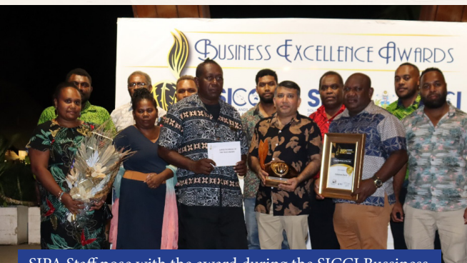
SIPA Staff pose with the award during the SICCI Business Excellence Awards.

Adding to this year's success for SIPA, was winning the 2021 Business Excellence Awards 'Large Business of the year award' in November this year. The award was awarded to SIPA by the Solomon Islands Chamber of Commerce in recognition of SIPA's ongoing success and outstanding contribution to the country's public and private sector. This was SIPA's first time to enter the Business Excellence Awards since its inception and was selected as a winner amongst 54 other submissions. Flanked by numerous successful developments in improving infrastructure, and overall service delivery