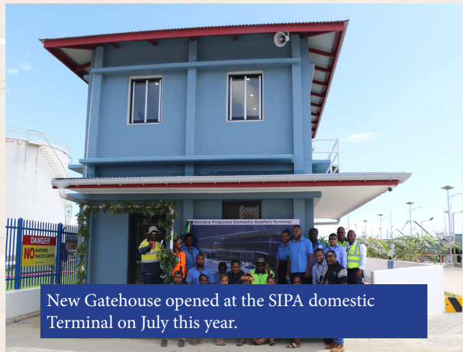
New Gatehouse opened at the SIPA domestic Terminal on July this year.