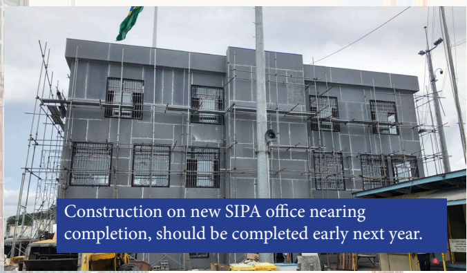
Construction on new SIPA office nearing completion, should be completed early next year.