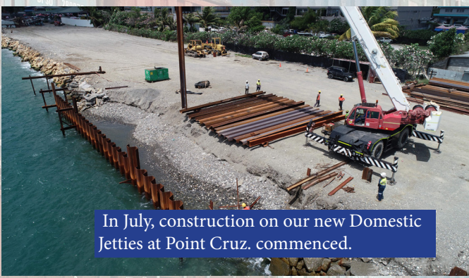
In July, construction on our new Domestic Jetties at Point Cruz. commenced.