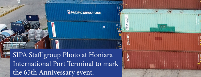
SIPA Staff group Photo at Honiara International Port Terminal to mark the 65th Anniversary event.