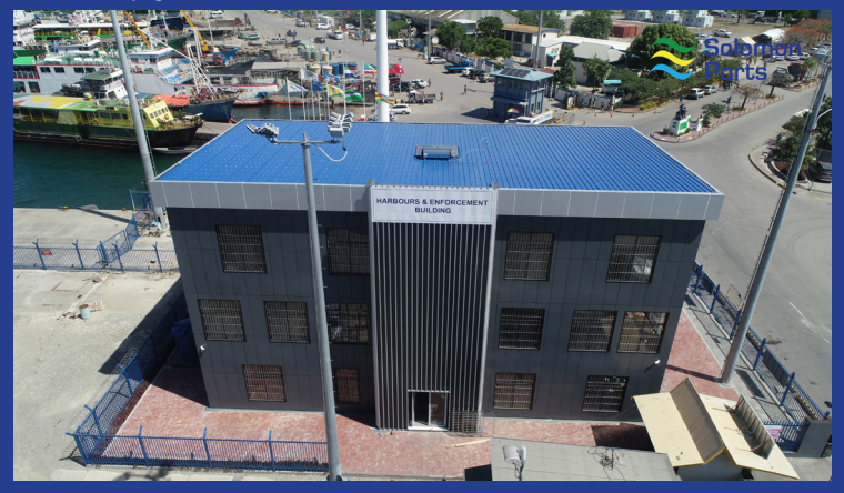
Aerial view of the new Habours and Enforcement building.