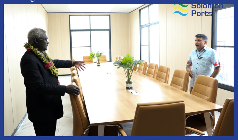
SIPA CEO and Prime Minister Hon. Manasseh Sogavare inside the new Habours building mini boardroom.