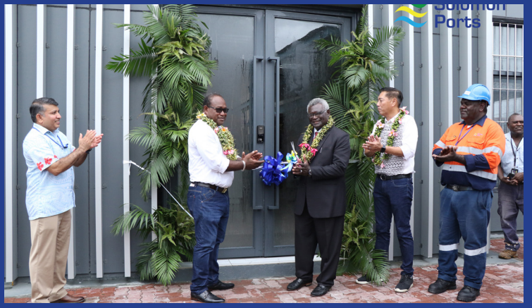
Prime Minister Hon. Manasseh Sogavare cuts the ribbon to open the new Habours and Enforcement building.