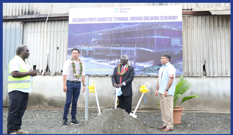
Ground breaking ceremony of the proposed new Honiara Port Domestic Terminal.