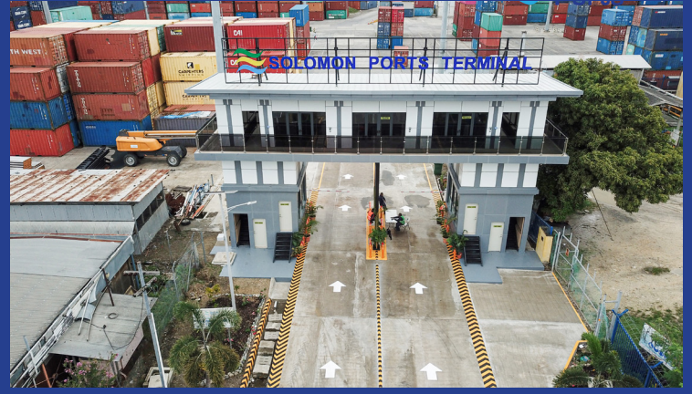
Aerial view of the new Overhead entry gatehouse to the international terminal.