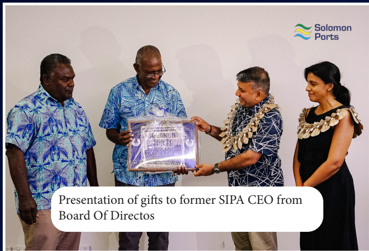
Presentation of gifts to former SIPA CEO from Board Of Directors