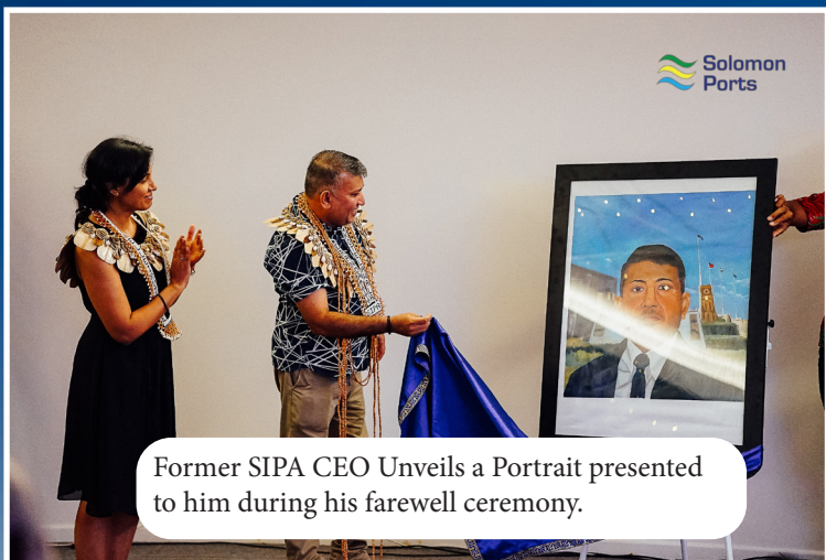
Former SIPA CEO Unveils a Portrait presented to him during his farewell ceremony.