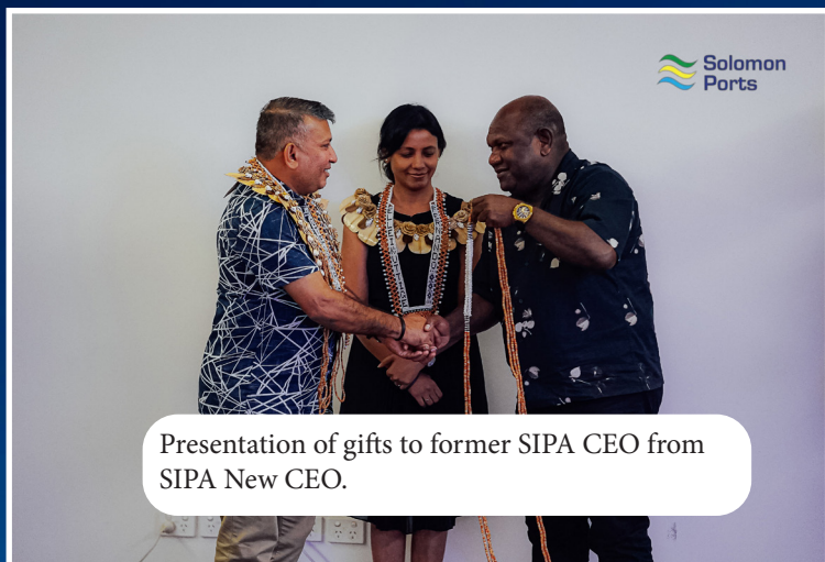
Presentation of gifts to former SIPA CEO from SIPA New CEO.