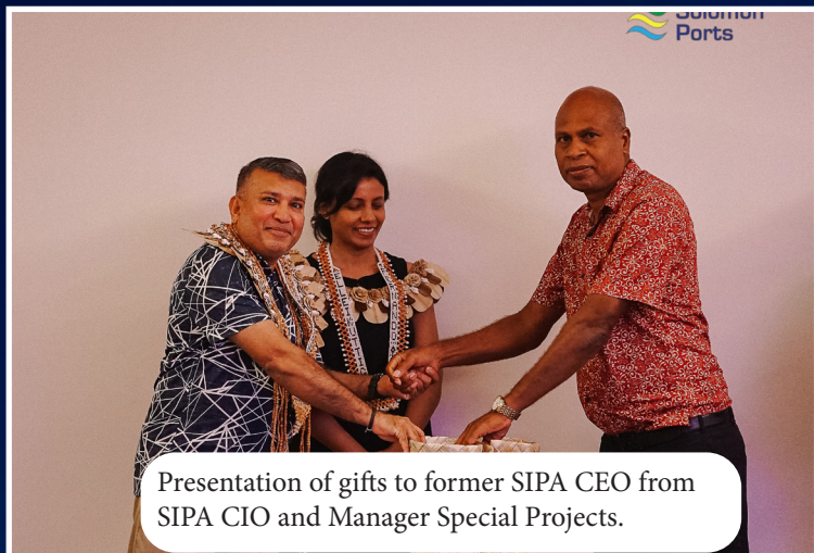
Presentation of gifts to former SIPA CEO from SIPA CIO and Manager Special Projects.